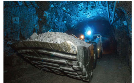
Enables tele-operation of an LHD between shifts and autonomous control from the muck pile to the ore pass