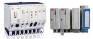
ABB PROCESS ANALYTICS

Providing real-time analysis of a process sample or stream.