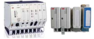
ABB PROCESS ANALYTICS

Providing real-time analysis of a process sample or stream.