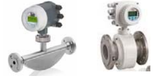
ABB PROCESS ANALYTICS

Providing real-time analysis of a process sample or stream.